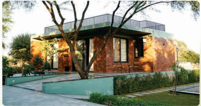
ACTUAL SITE PICTURES